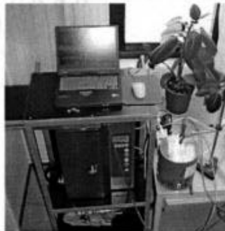
Figure 1. Test set up.

The air cleaner was placed on a desk. The concentration was measured by altering between up- and down-stream (15 mm above the outlet in the center) of the air cleaner. An ELPI (Electrical Low Pressure Impactor, Dekati FIN) was used to measure numbers and sizes of the particles.